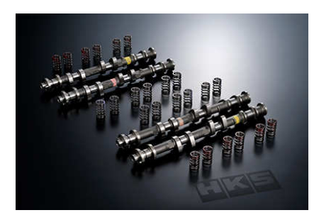
HKS high duration camshafts ensure the smooth acceleration to high engine speed.