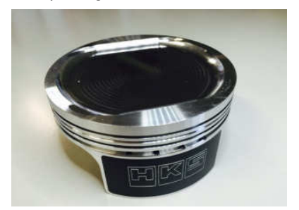
Molybdenum coated billet pistons reduce friction and prevents galling at the initial stage.